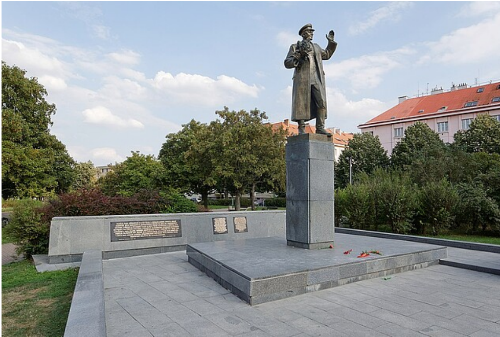
Statue of the Soviet marshal Ivan Stepanovich Konev (by Zdeněk Krybus) already with the added plaques in different languages describing his wider role in the region during the Cold War.