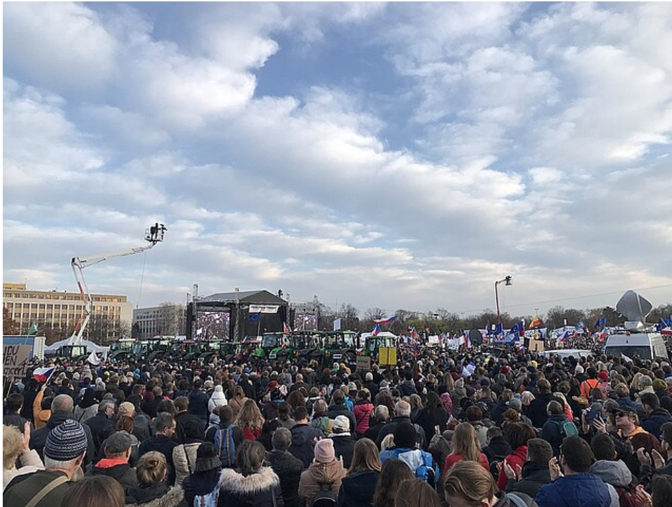
Mass anti-government demonstration in June 2019 at Letná park in Prague.