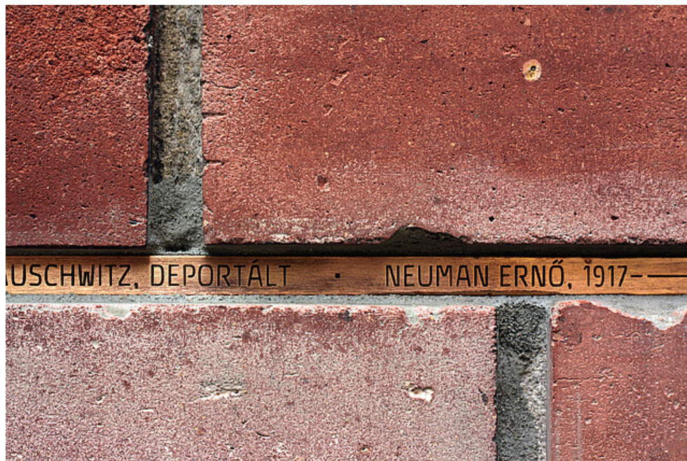
Picture of Names in Mortar Joints, the new memorial site for citizens of the Budapest University who fell victim of the Shoah and the Second World War