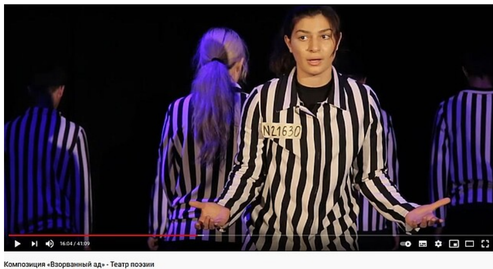
Theatre play 'Vzorvannyi ad' (A Hell Blown Up) at the Poetry Theatre in Makhachkala (Dagestan, RF) in November 2020.