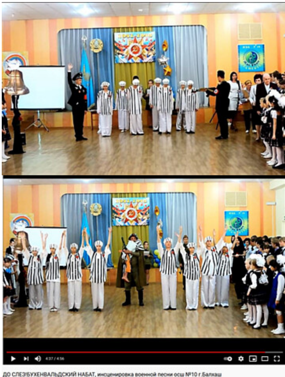
A staging of 'Bukhenval'dskii nabat' at a school in Kazakhstan uses costumes of camp inmates, SS-guards (with swastika) and Red Army soldiers, January 2016