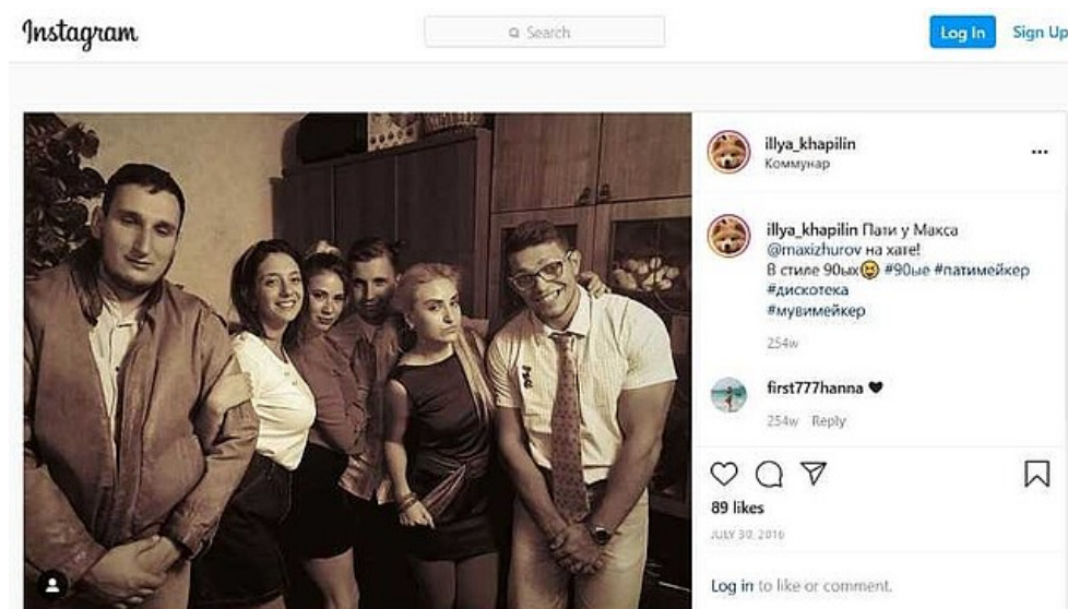
Referencing content on Instagram: re-enacting a nineties-style party.