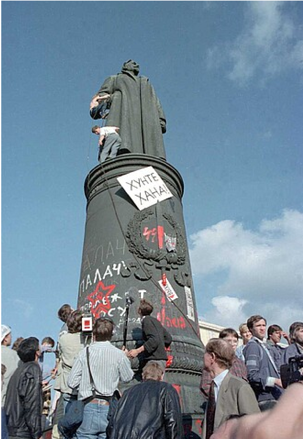
People gather to take down the monument to Feliks Dzerzhinsky on Lubyanka square in Moscow, 1991.