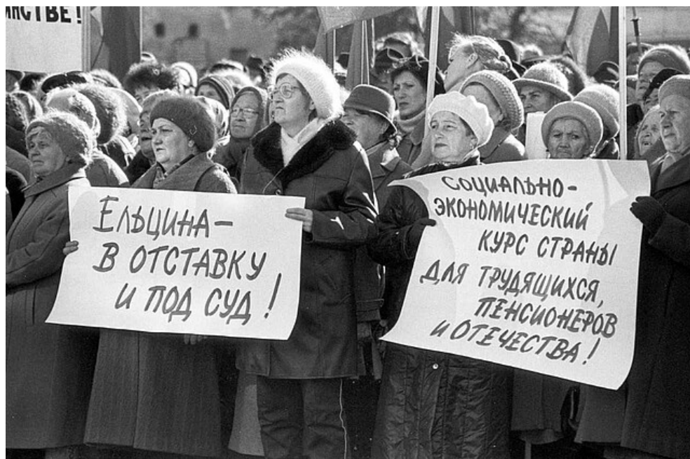
Protests against Yeltsin's economic reforms in October 1998.