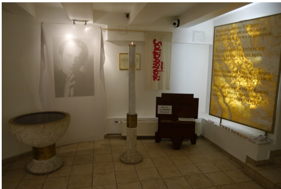
The last room "Christianity leads to Resurrection" presents the victory of God over evil. There is a possibility to pray in this room. Author: Dariusz Bogumił