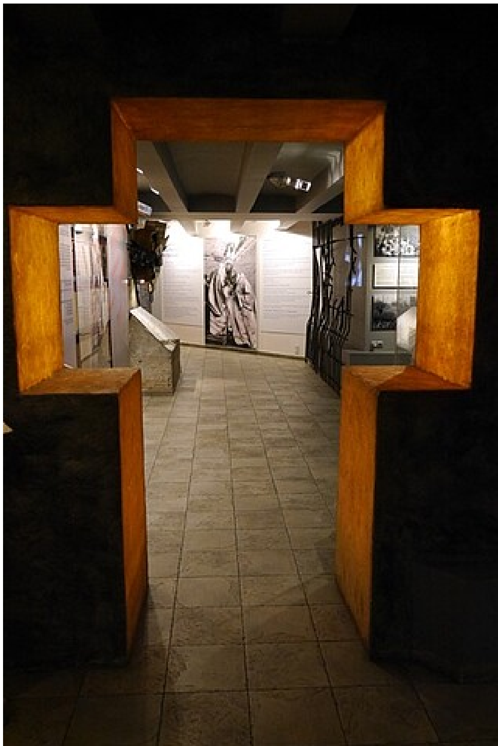
The cross-shaped entrance to the exhibition