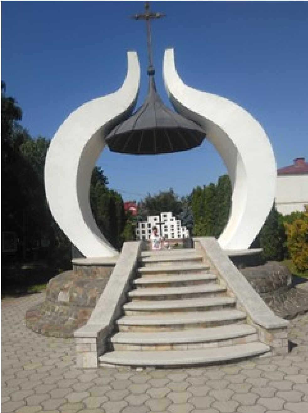
Memorial to the 1990-92 conflict in Varnița in very close proximity to Bender.