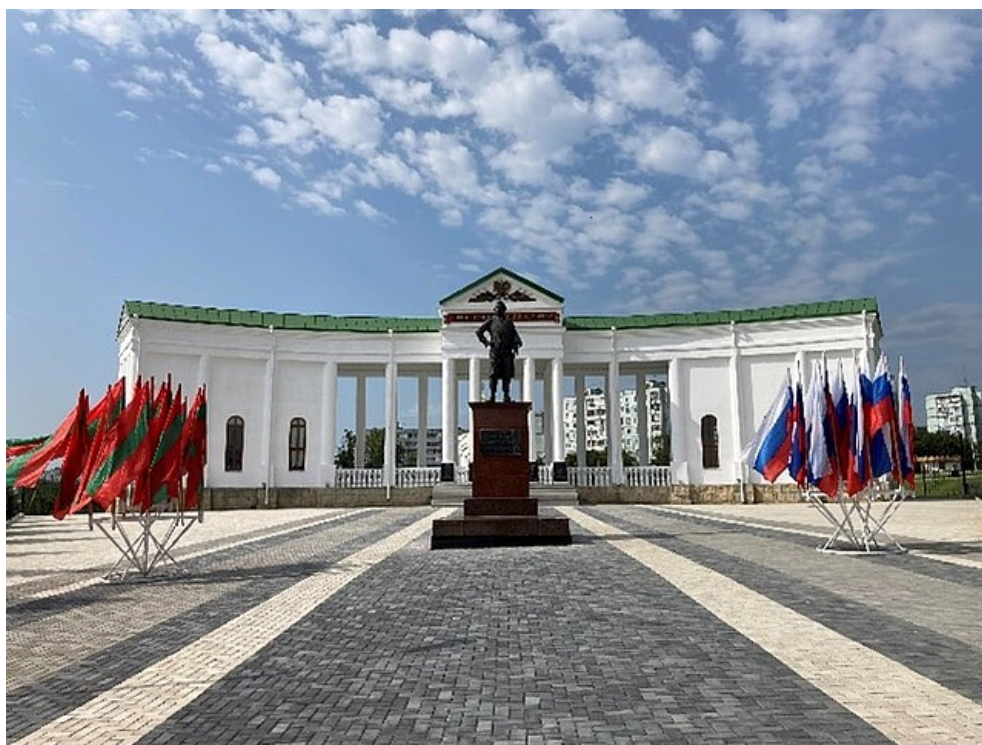
Memorial necropolis in Bender (reconstructed in 2006-2008) with Transnistrian and Russian flags.