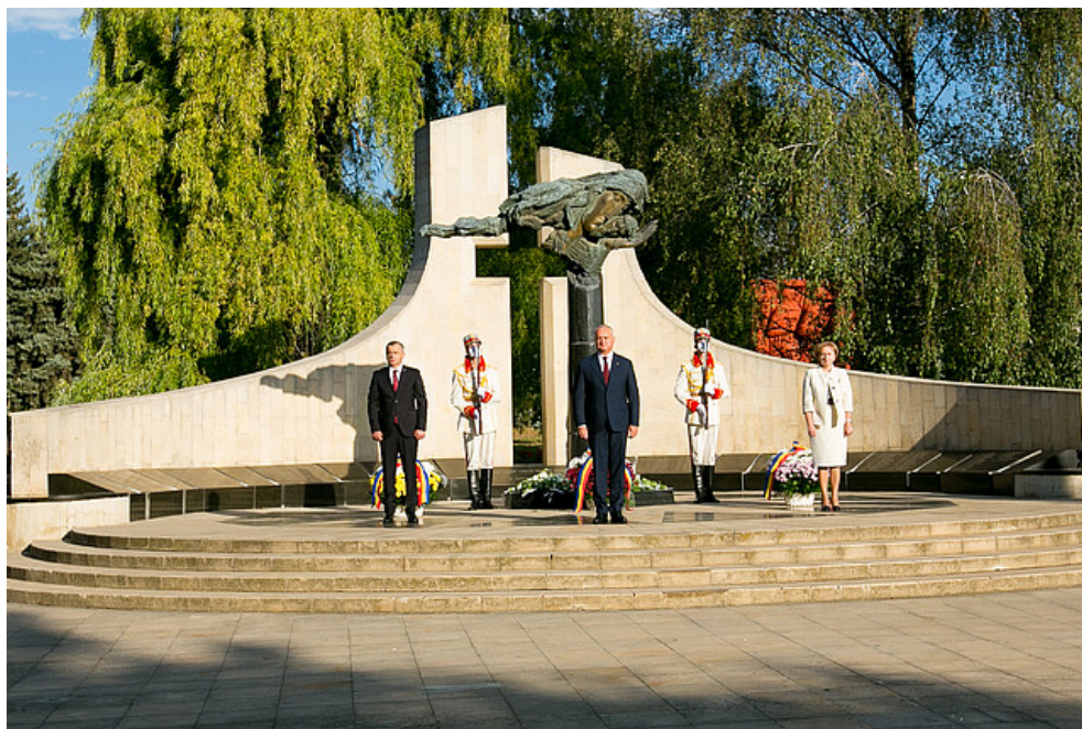
Members of Moldova's Parliament stand in front of the memorial to the 1990-92 conflict "Grieving Mother" in the Chișinău memorial complex "Eternitate", 27 August 2020.