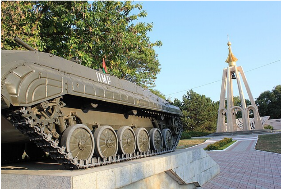
"Memorial of Memory and Sorrow" (built in 1993-95) in Bender, a town in non-recognized Transnistria.