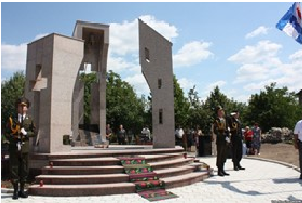
Memorial to the 1990-92 conflict in the village of Cocieri.