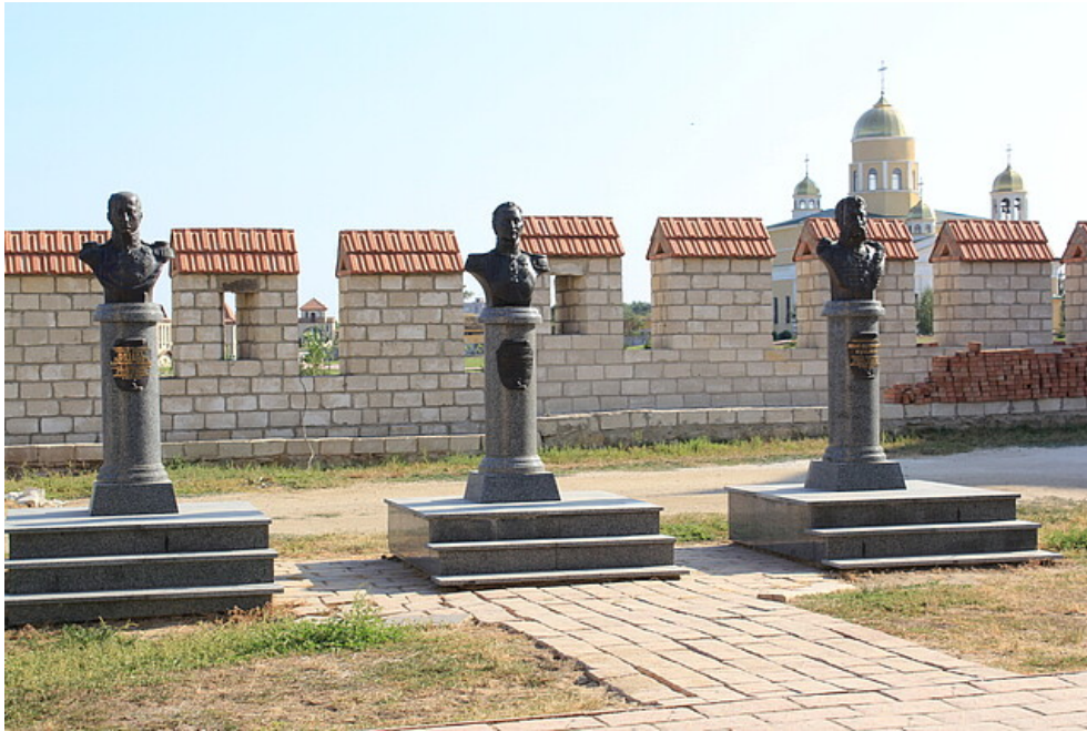
An alley with busts of Russian imperial military personnel at the Bender fortress (launched in 2009-2011).