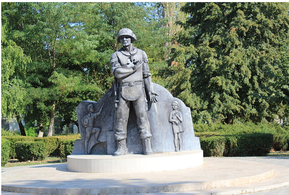
Monument built in 2017 to a Russian piece-keeper in Bender.