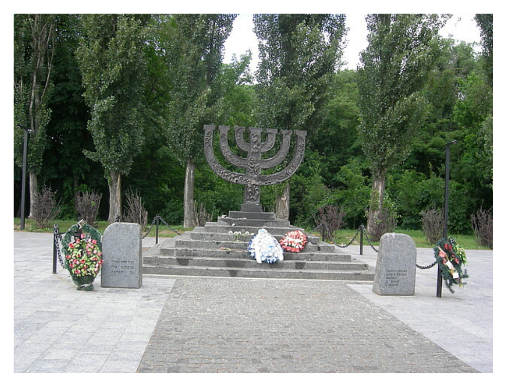
The Menorah monument to the Jews massacred at Babi Yar