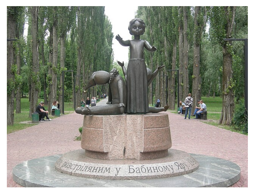
Monument in memory of children murdered at Babi Yar