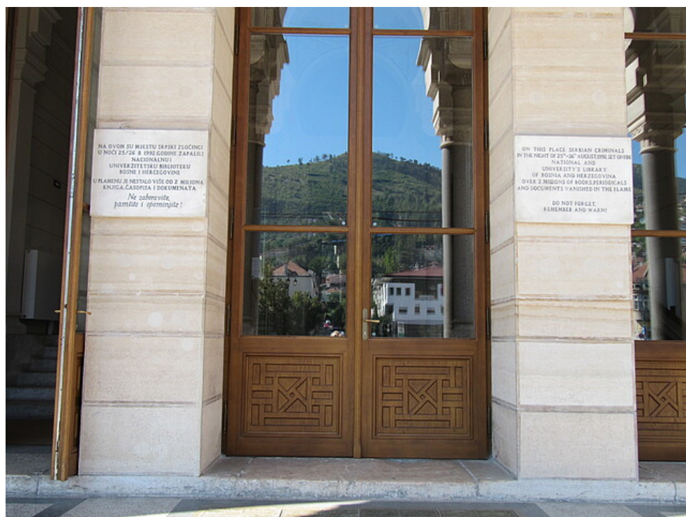
Plaque to commemorate the destruction of the National and University Library in 1992