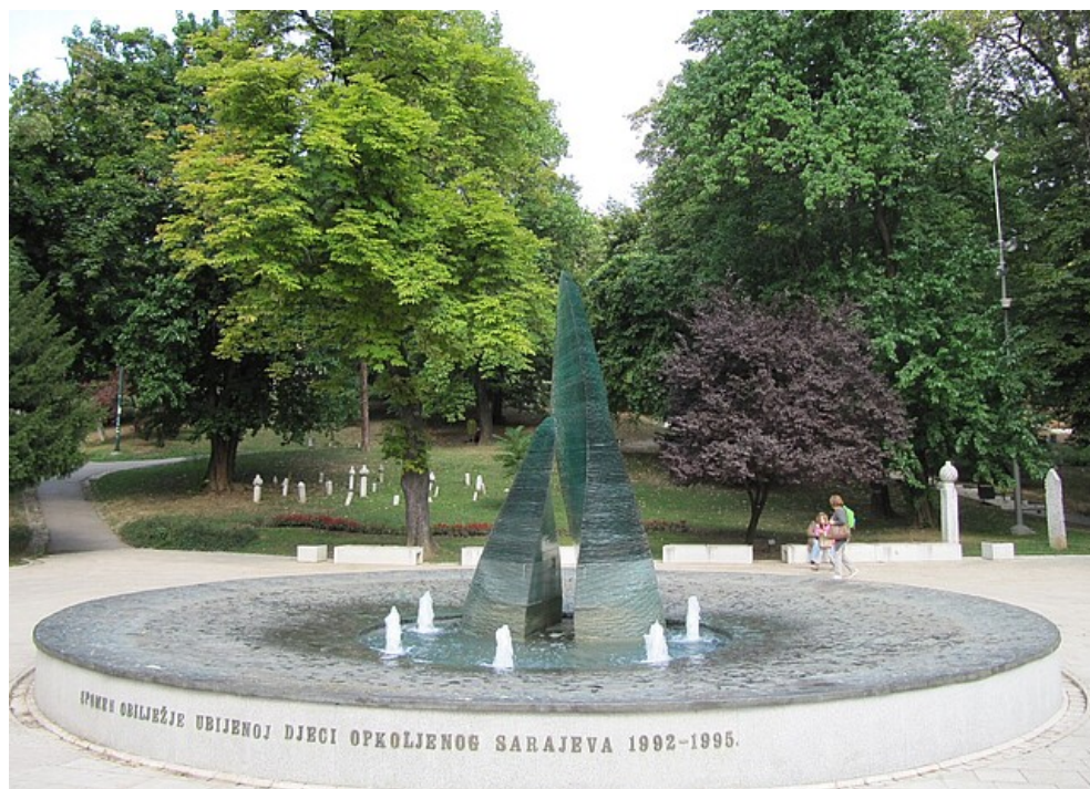
Memorial commemorating the children killed during the siege of Sarajevo.