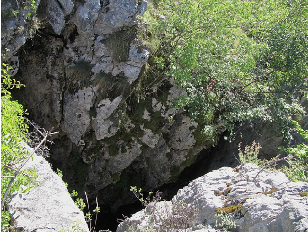
Kazani ravine in the Trebević massif