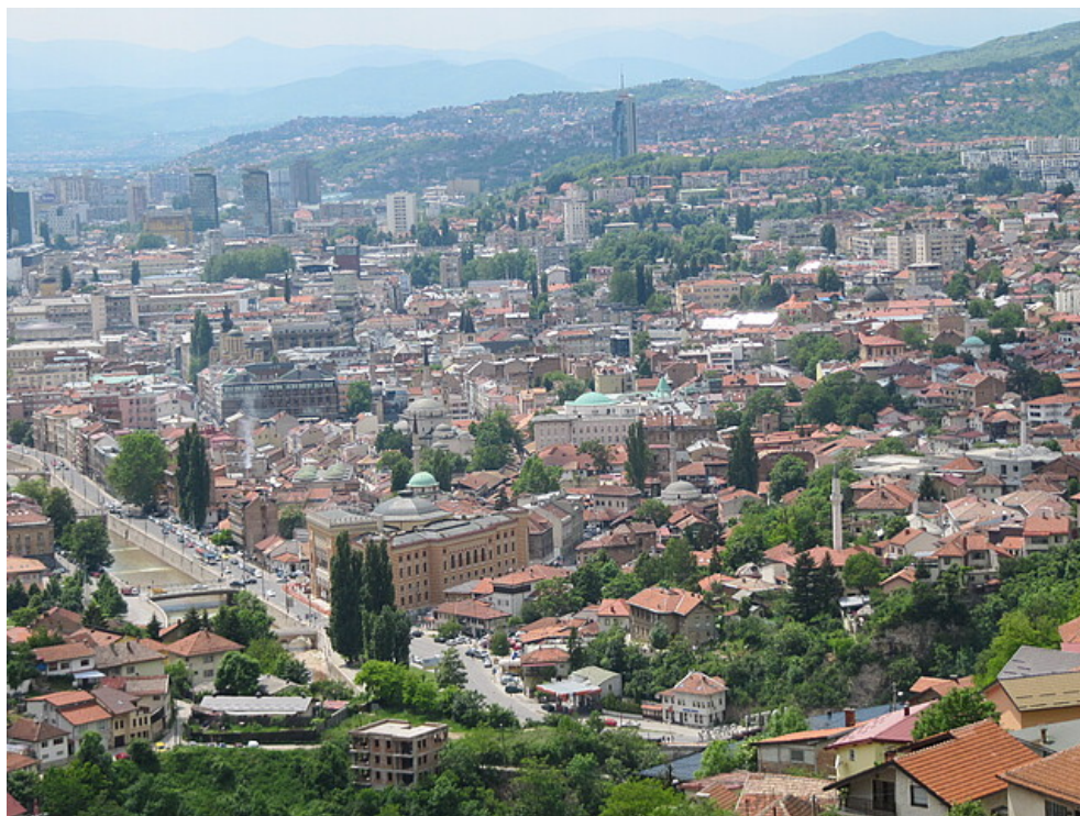
View on the city of Sarajevo