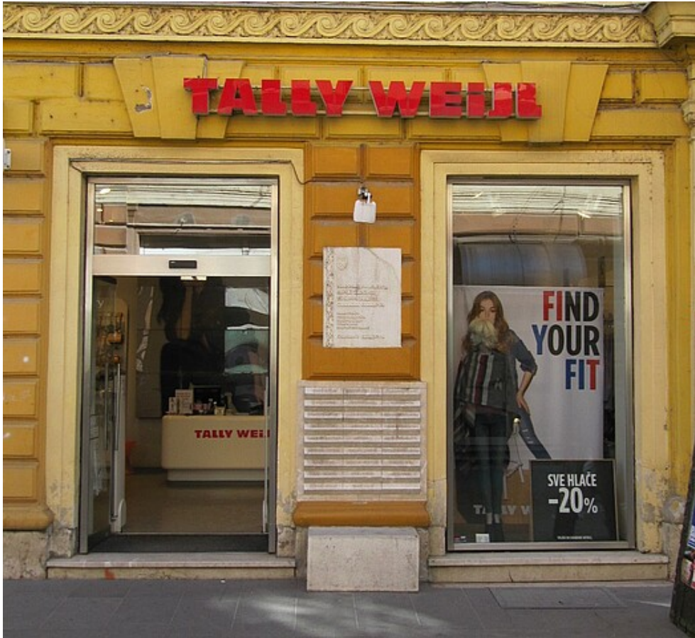
Plaque to commemorate the market place massacre in Sarajevo in 1993