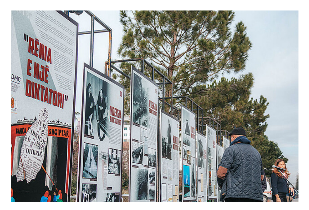
Street exhibition "The Fall of the Dictator" in downtown Tirana, put up by the IDMC in February 2021