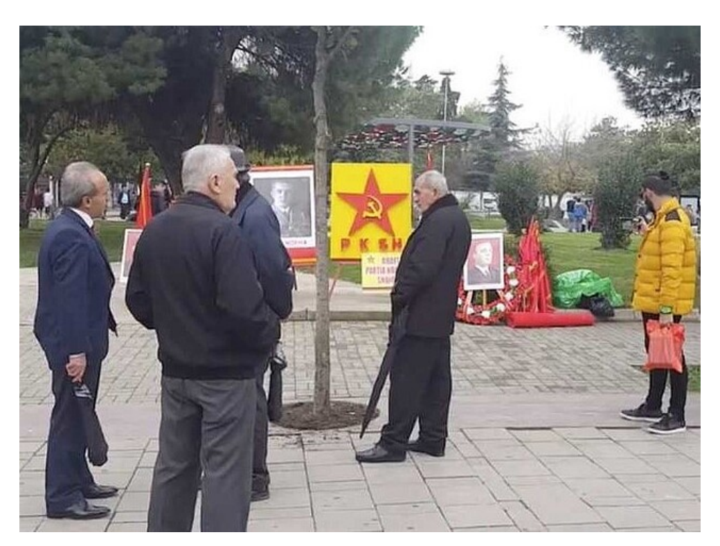
A public commemoration of the communist partisans in Tirana, November 2017, displaying among others photos of dictator Enver Hoxha and the symbols of the Communist Party