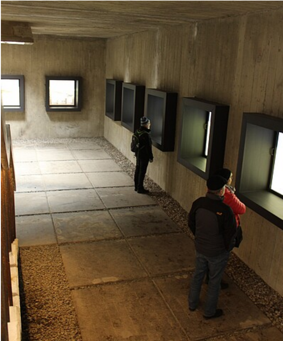
Each box in the first room is dedicated to one group of prisoners Author: Paula Oppermann