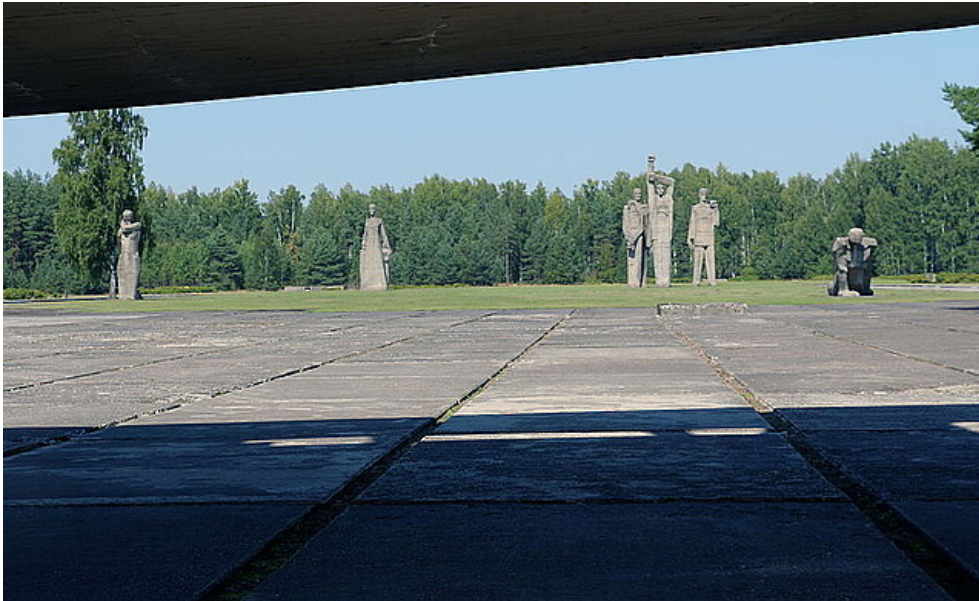
View through the memorial gate on to the former camp area; in the background are the sculptures erected in 1967