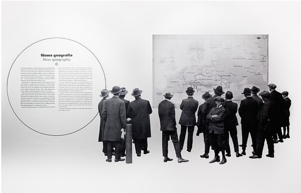
Section "New Geography": US public watching new European maps Author: Michalina Bigaj © Weird Gentlemen / photo Michalina Bigaj