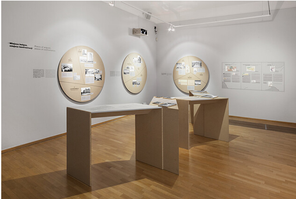
Section "New Geography": panels devoted to conflicts of memory and dissonant heritage Author: Michalina Bigaj © Weird Gentlemen / photo Michalina Bigaj