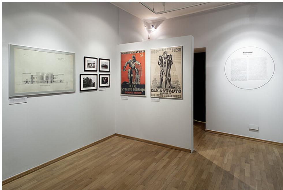
Section "New Order": panels devoted to architecture and monuments in Kaunas Author: Michalina Bigaj © Weird Gentlemen / photo Michalina Bigaj