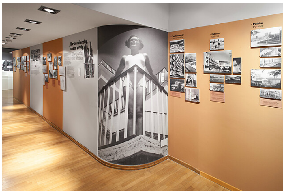
Section "New Man": panels devoted to modernist architecture for health and relaxation Author: Michalina Bigaj © Weird Gentlemen / photo Michalina Bigaj