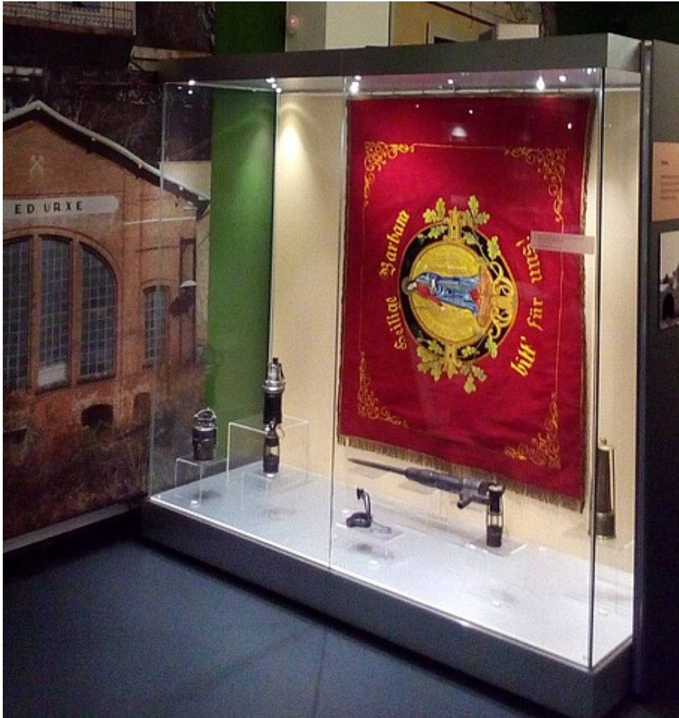
The Banner of a coal mining brotherhood at the Opava Museum.