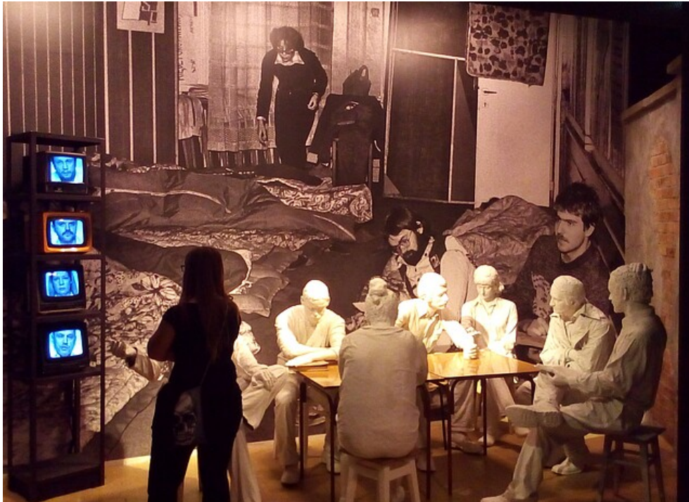
Diorama with figures recreating the atmosphere of the strikes during the Solidarność movement. Author: Ondřej Tábořský