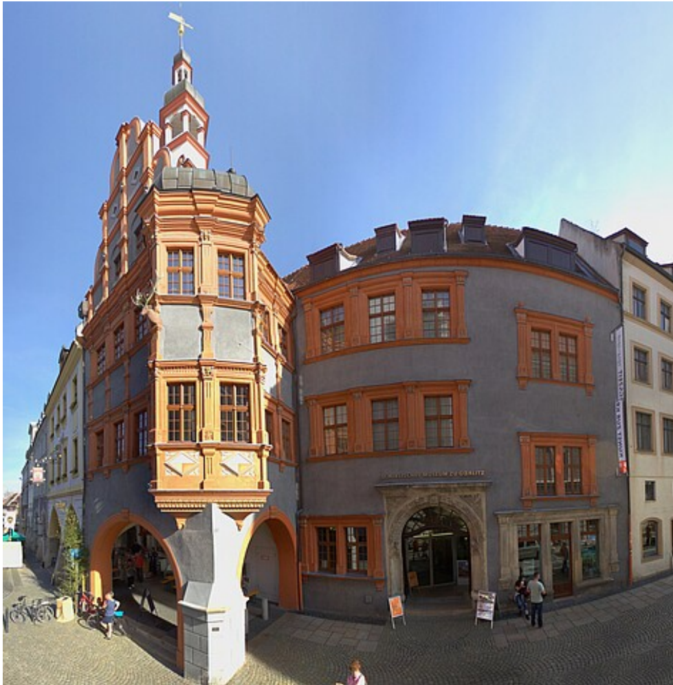
View of the Renaissance Palace Schönhof, location of the Silesian Museum in Görlitz