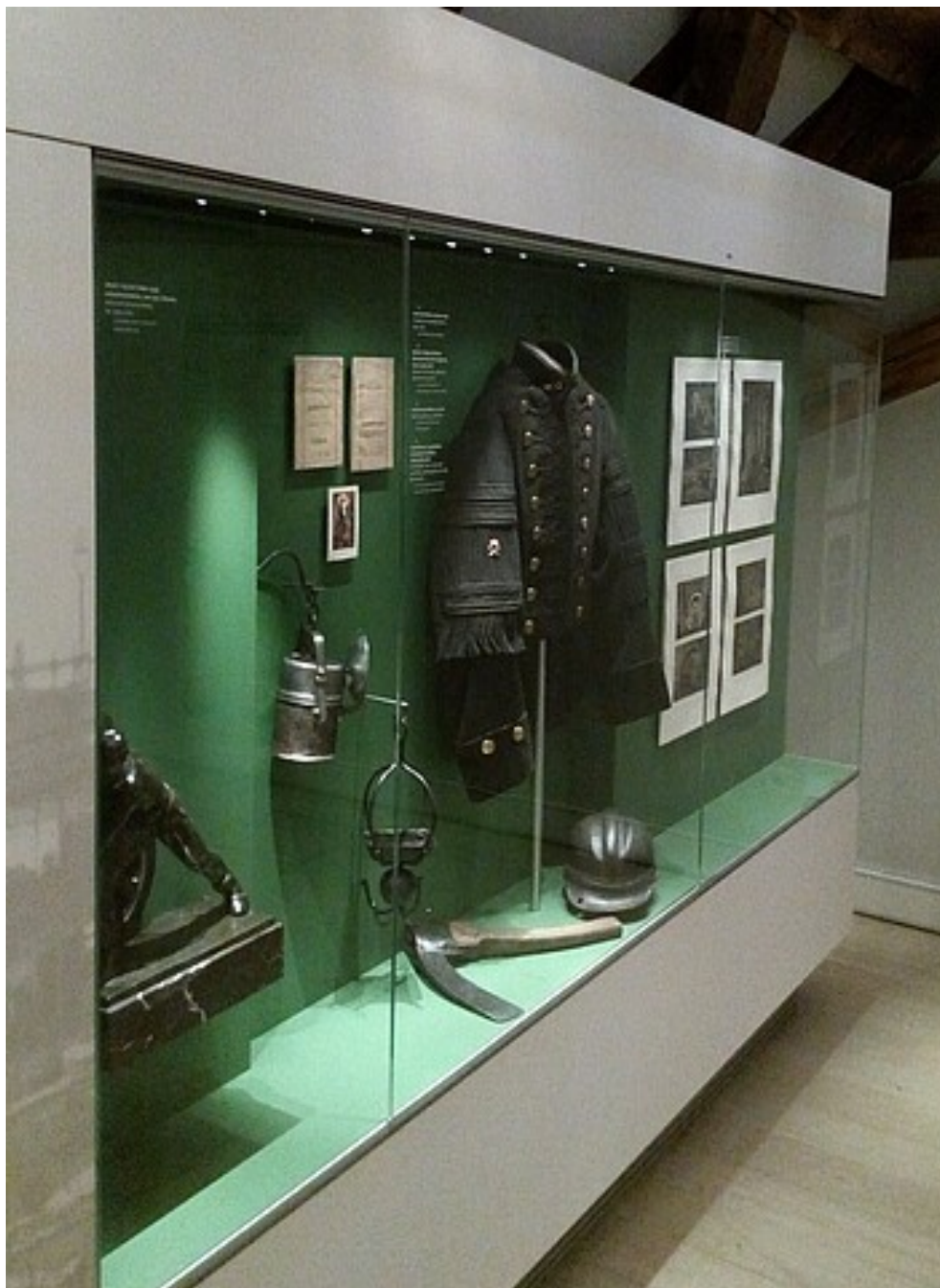
A recurrent theme in all three museums: the mining industry. Here a mining uniform with equipment at the museum in Görlitz.