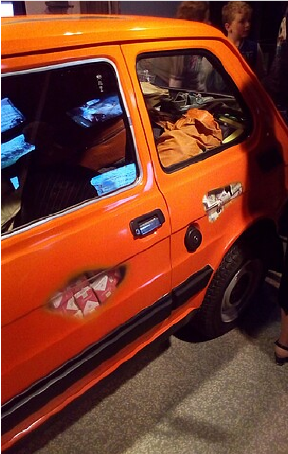
A Polish Fiat 126p, produced in Tychy, serves as a symbol of the 1970s and 1980s at the Katowice museum. Author: Ondřej Tábořský