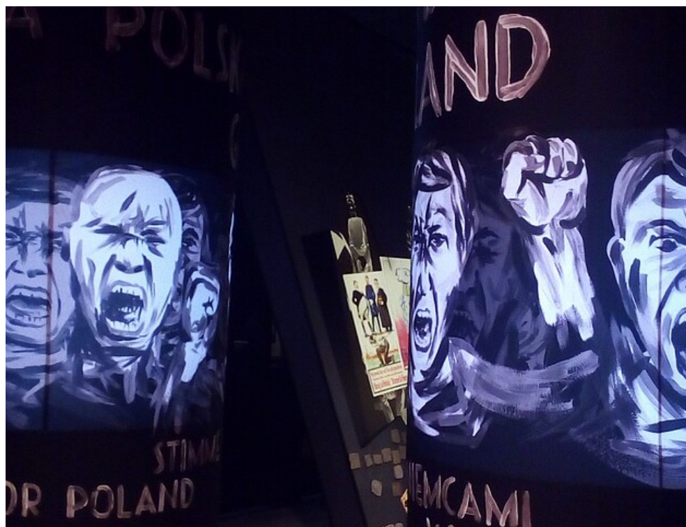
Pillars with expressive graphics serving as an entry to the section that is dedicated to the Upper Silesian plebiscite in 1921. Author: Ondřej Tábořský