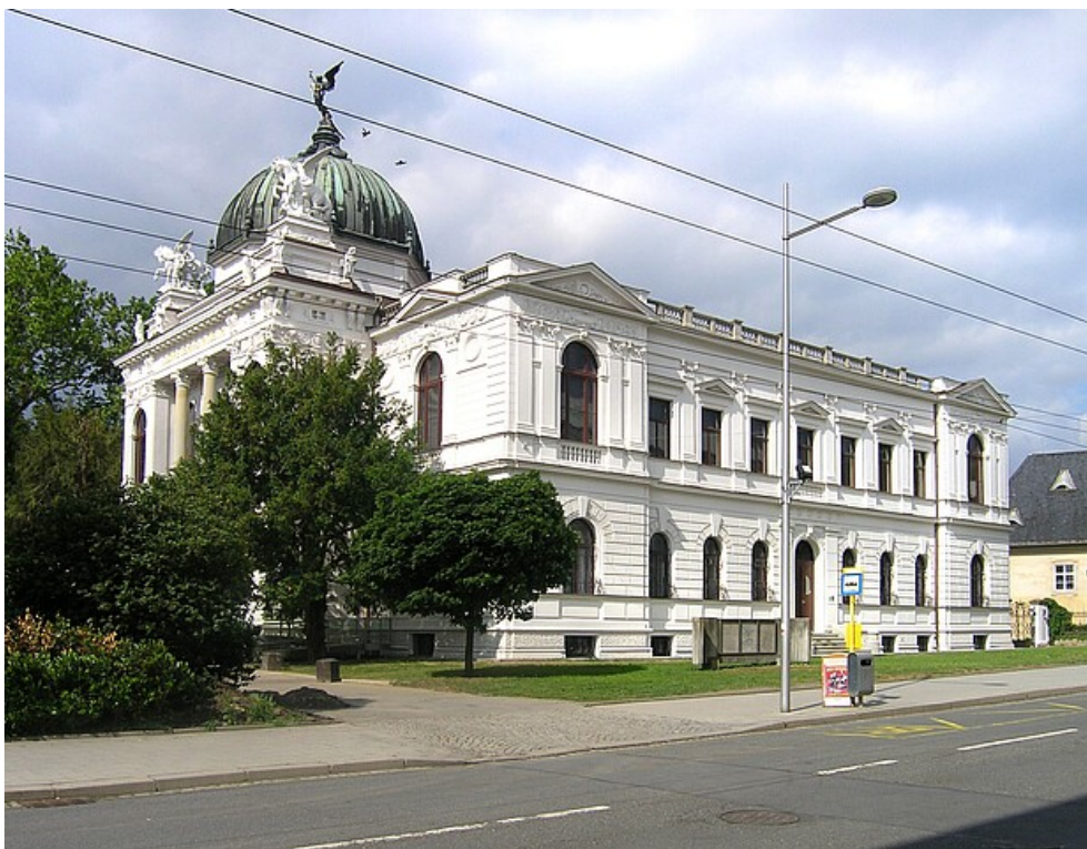
View of the Silesian Museum in Opava, Czech Republic