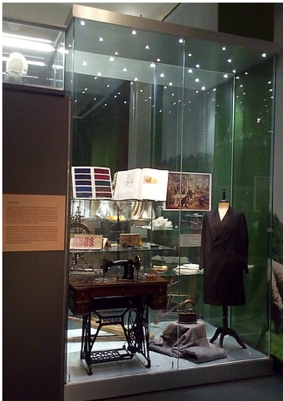
Glass case displaying items from the Silesian textile industry.