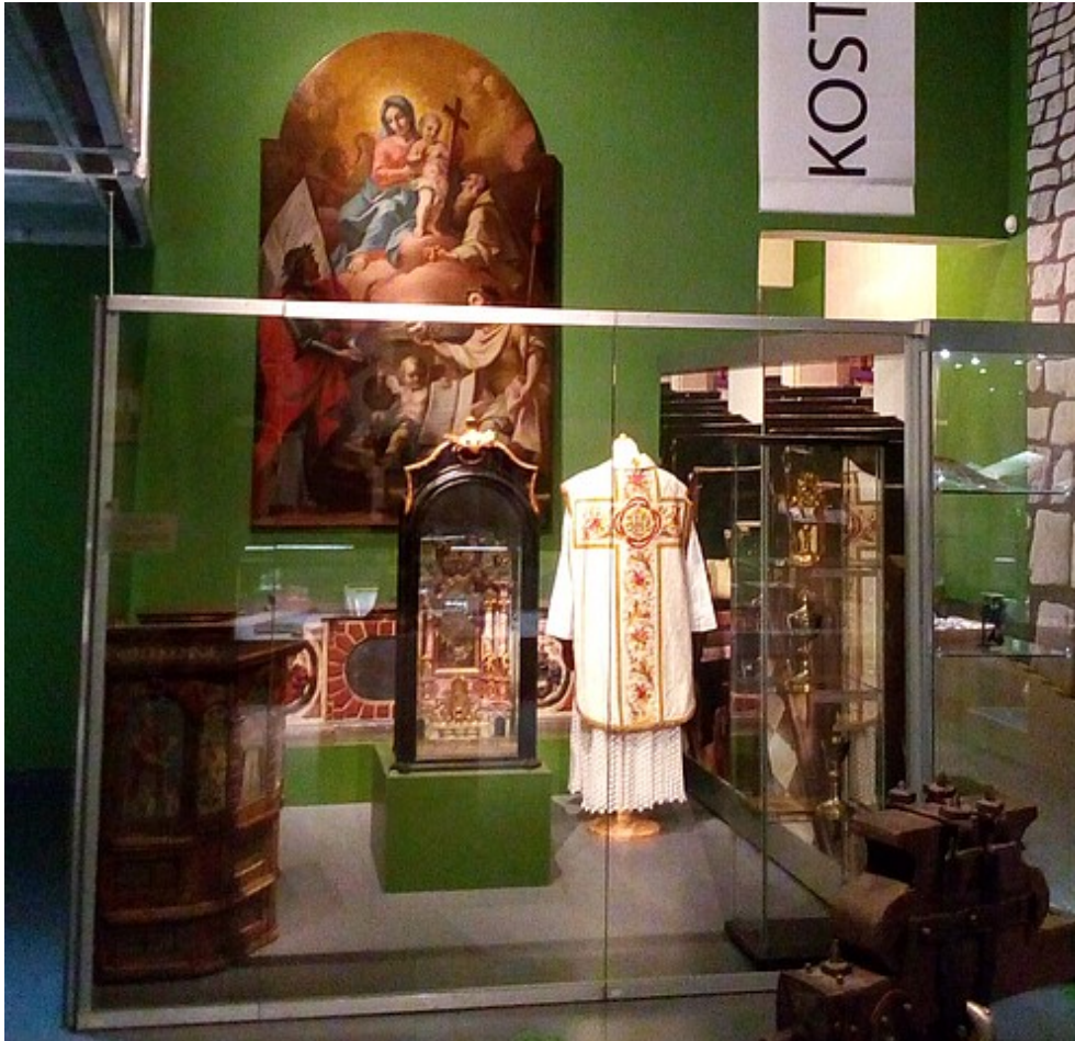
A display depicting the religious situation in Czech Silesia.