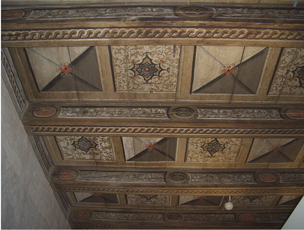
One of the painted ceilings dating from the 16th century in the Silesian Museum in Görlitz.

Author: Paulis; URL: https://upload.wikimedia.org/wikipedia/commons/5/59/Goerlitz_Schlesisches_Museum_01.jpg