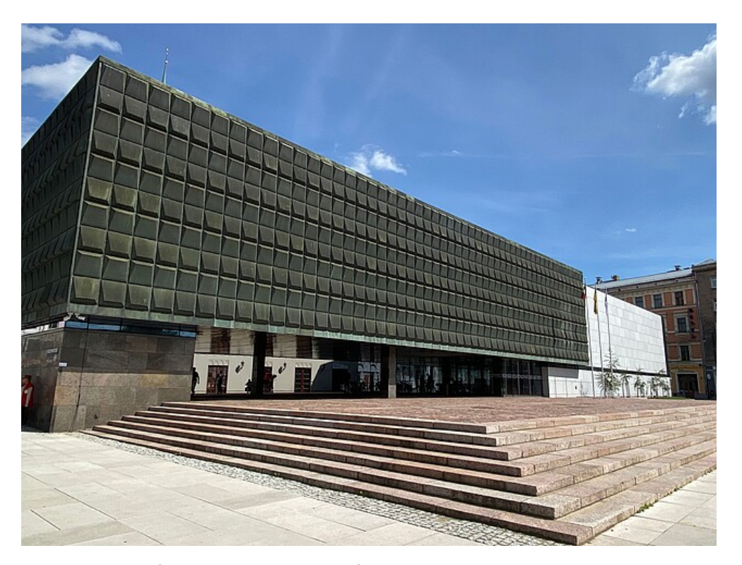
The old building of the Occupation Museum from outside with the new, white annex in the back.