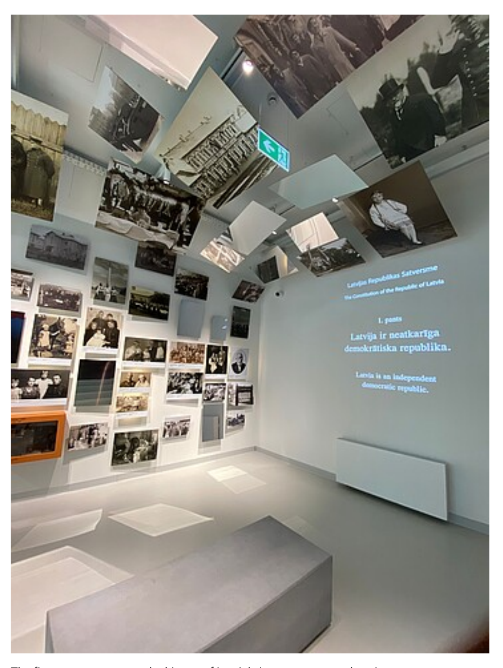
The first room represents the history of Latvia's interwar state and society.