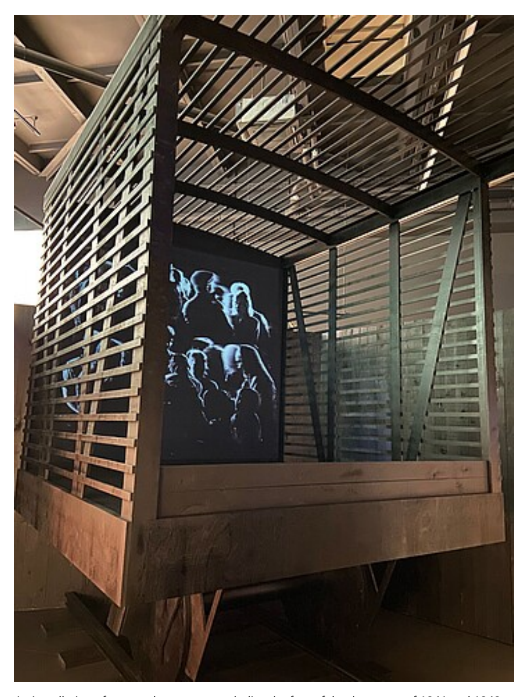
An installation of two cattle wagons symbolize the fate of the deportees of 1941 and 1949.