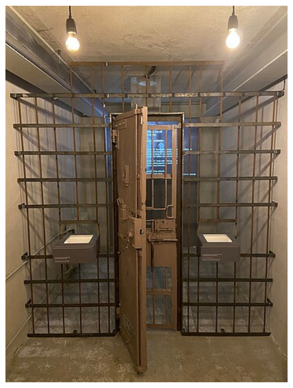
An authentic door from the notorous former KGB prison in Riga-Brasa.