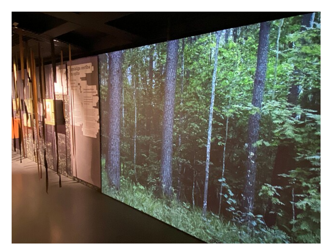
The story of the armed struggle against Soviet rule is introduced with a picture of a forest.

Design element: metal grid at the walls whenever the exhibition refers to the politics of the occupation powers – be it Soviet or Nazi.