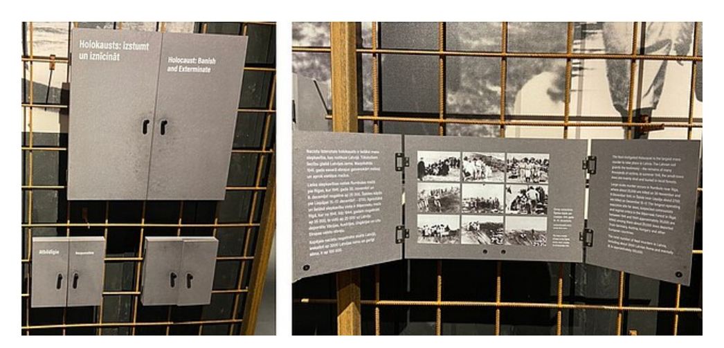
Window shutters hide images and stories about the mass killings of Latvia's Jews.