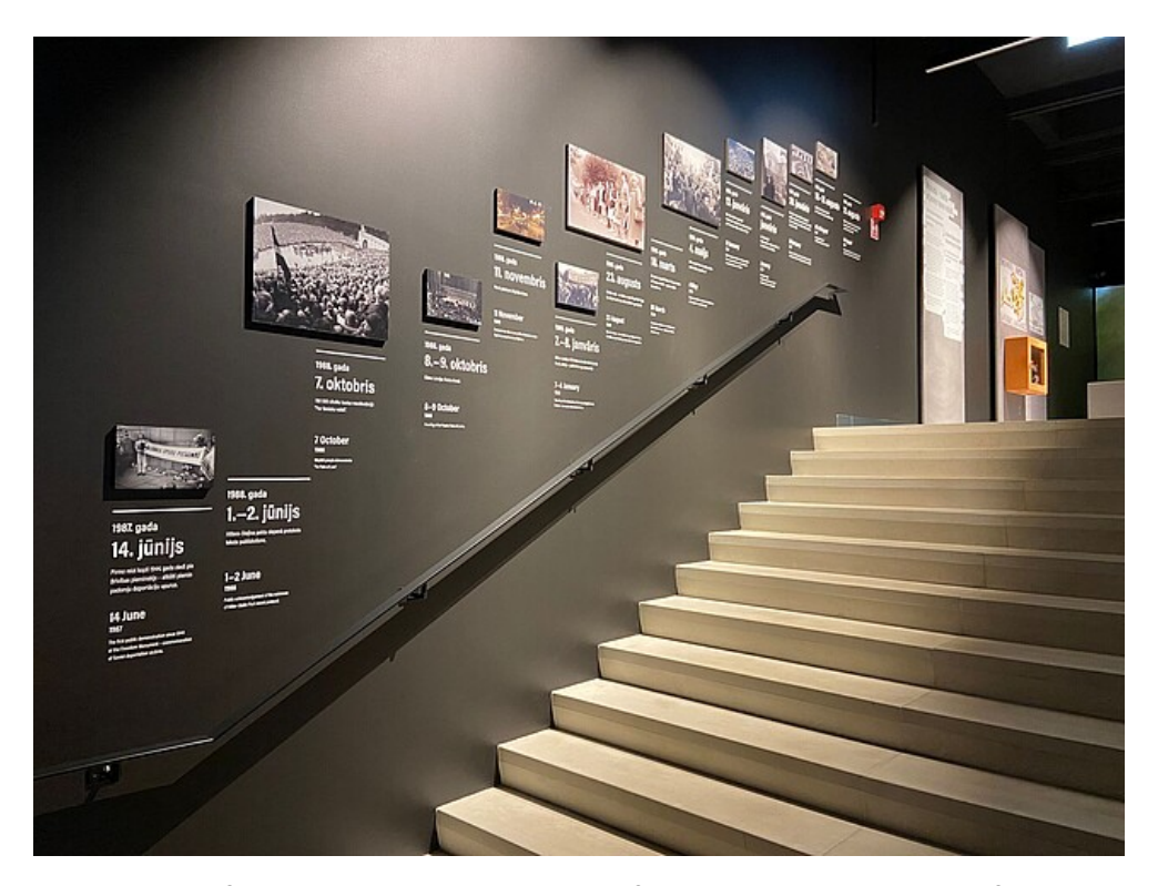
Along the wall of the staircase to the last section of the exhibition are key dates of the Latvian movement for the renewal of independence.