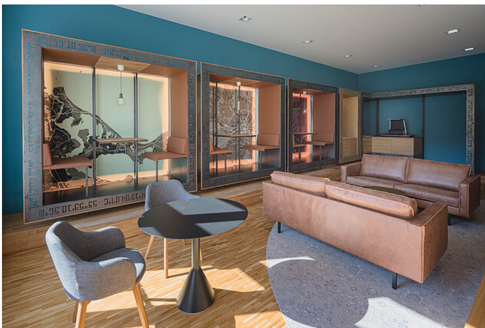
In small booths along the walls visitors can sit and listen to audio-recordings of life-stories (first floor)