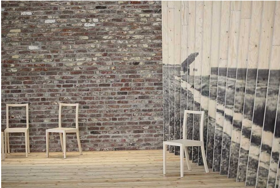
Room of Silence. Reminder of a lost home?