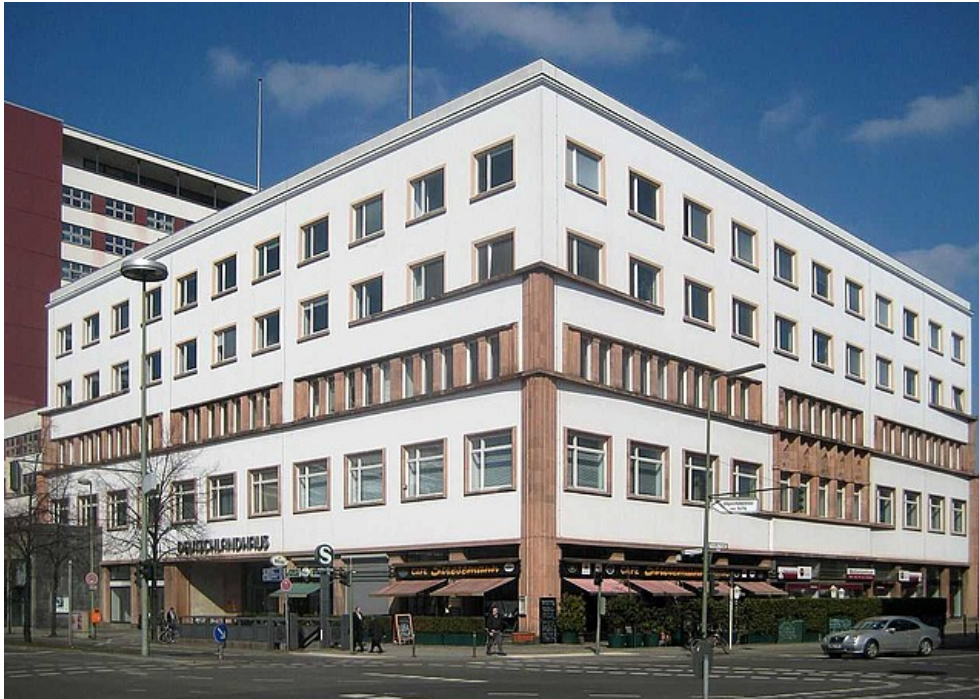
The Deutschlandhaus in Berlin's Stresemannstraße hosts the new Documentation Centre for Displacement, Expulsion, Reconciliation