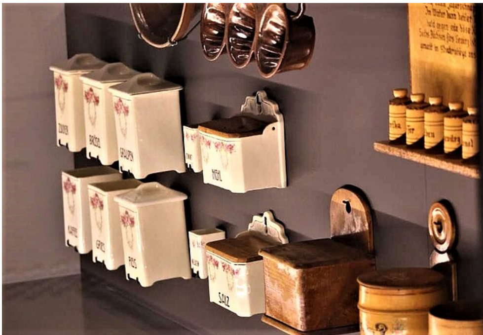
Objects from the Heimatstube in Gärtringen (Baden-Württemberg) illustrate the personal and collective remembering in small communities (second floor)