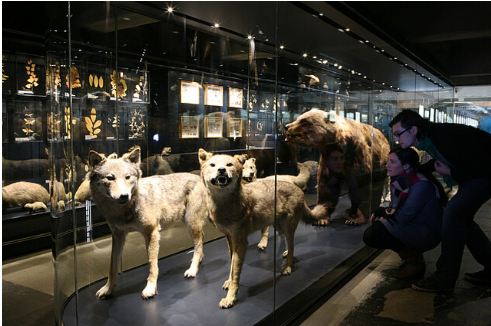
Nature. Culture. History. Permanent exhibition, section "Flora and Fauna"