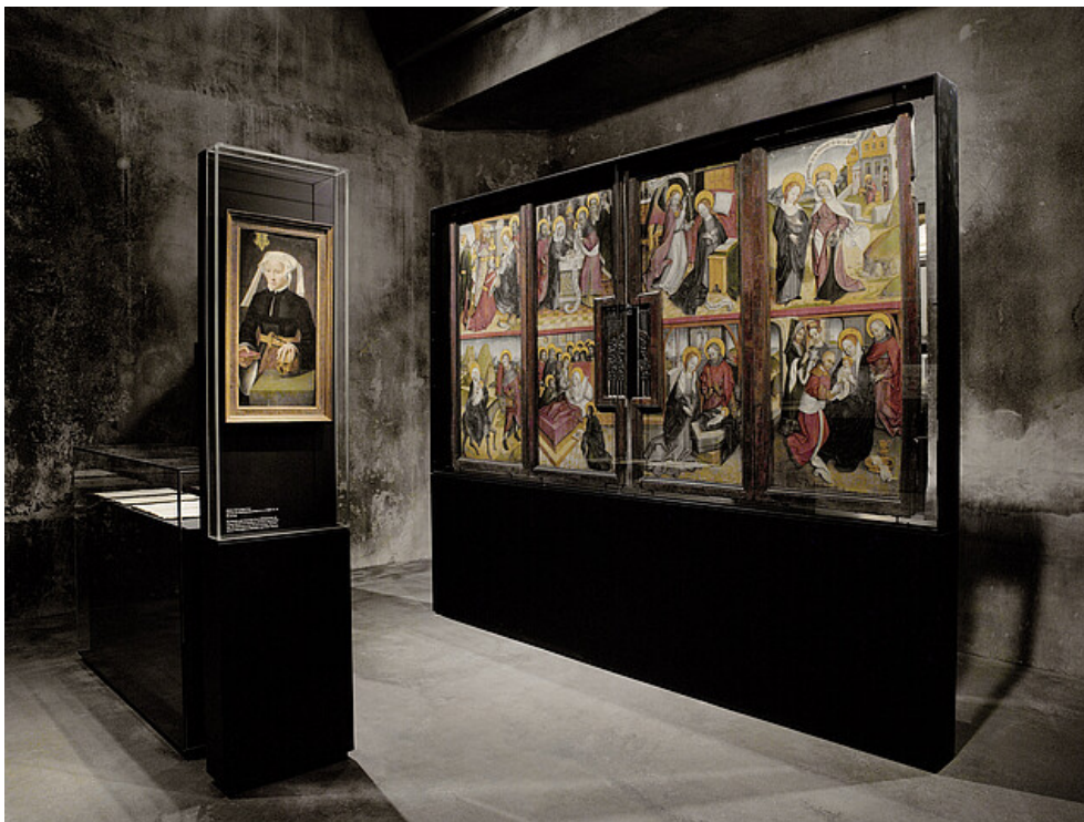
Reformation and religious war, permanent exhibition Author: Brigida González, Source: Ruhr Museum