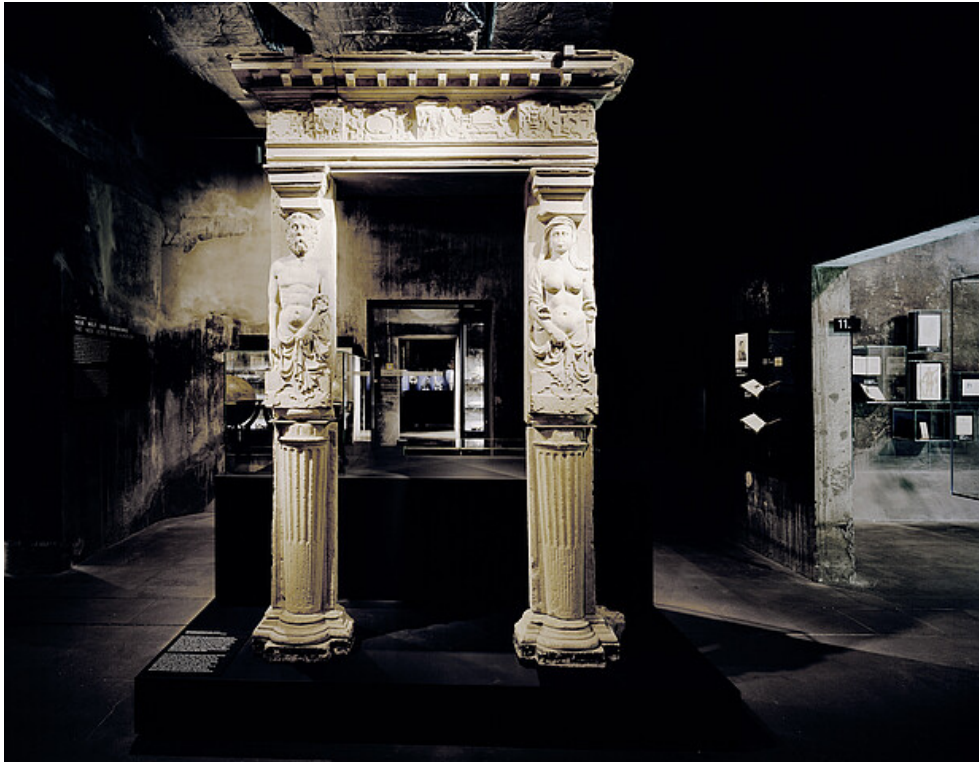
The "New World" and humanisms, permanent exhibition

Author: Brigida González, Source: Ruhr Museum