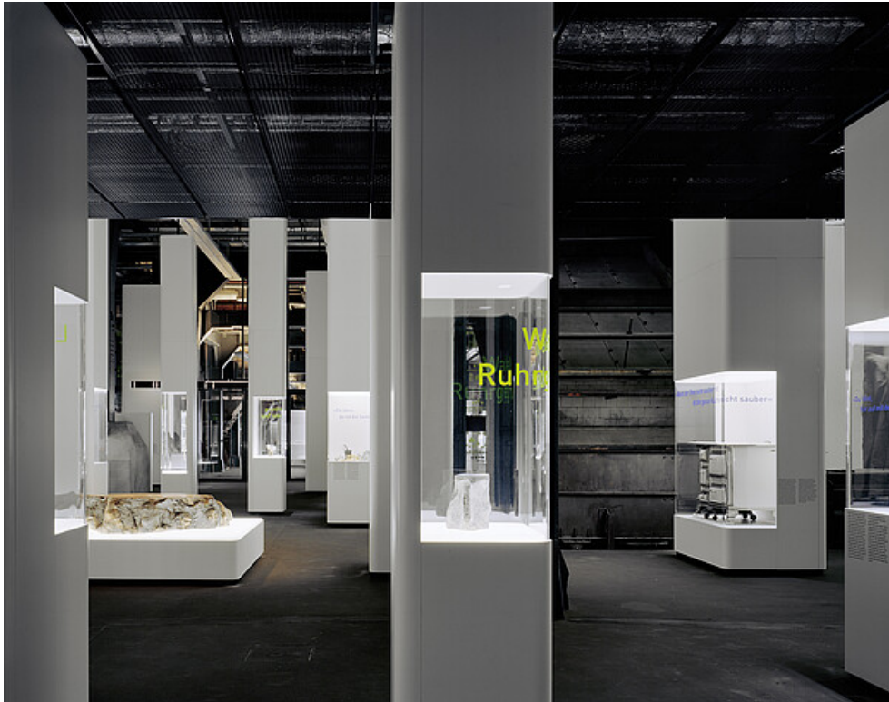
"Zeitzeichen", permanent exhibition Author: Brigida González, Source: Ruhr Museum