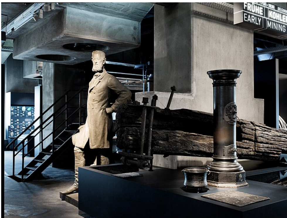
early coal production with a statue of Alfred Krapps, permanent exhibition

Author: Brigida González, Source: Ruhr Museum