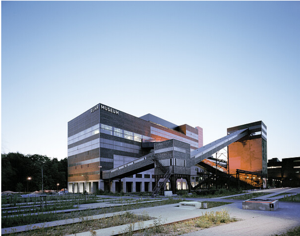
The former coal wash hosts the Ruhr Museum today Author: Brigida González, Source: Ruhr Museum