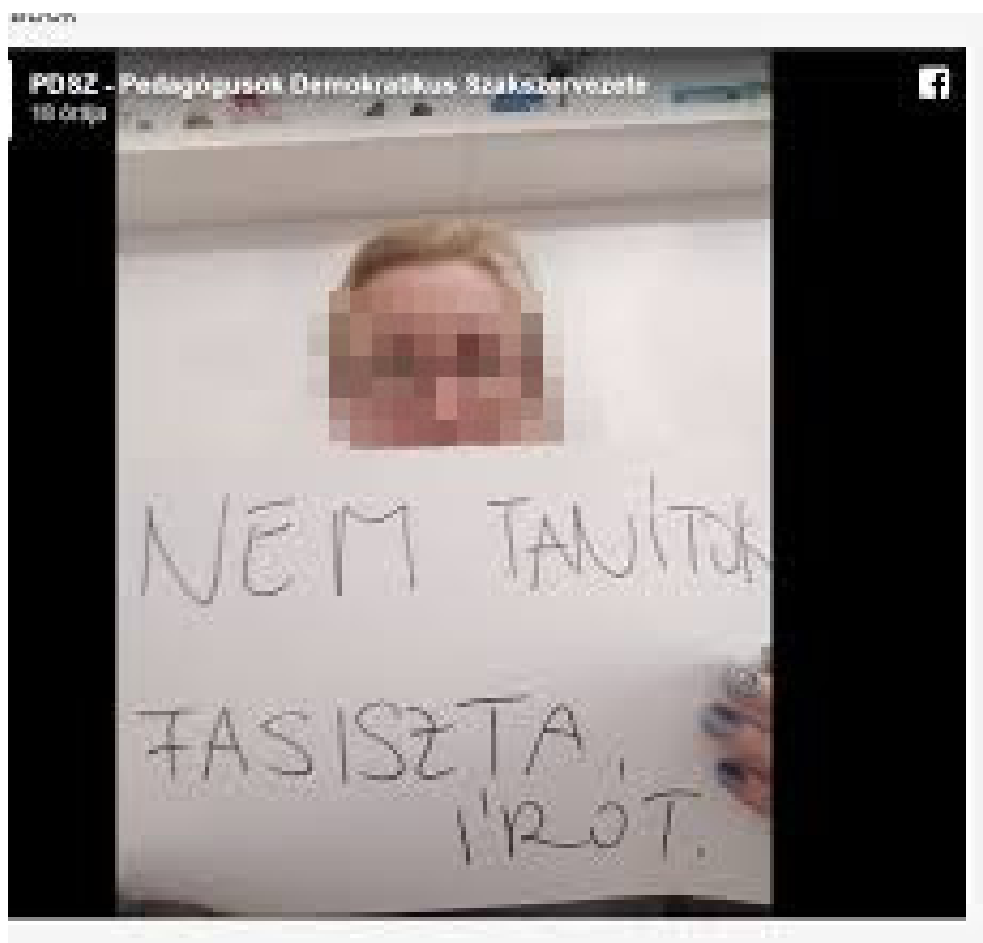
Teacher poses with sign "I don't teach fascist writers" in social media campaign #nonat

#nonat