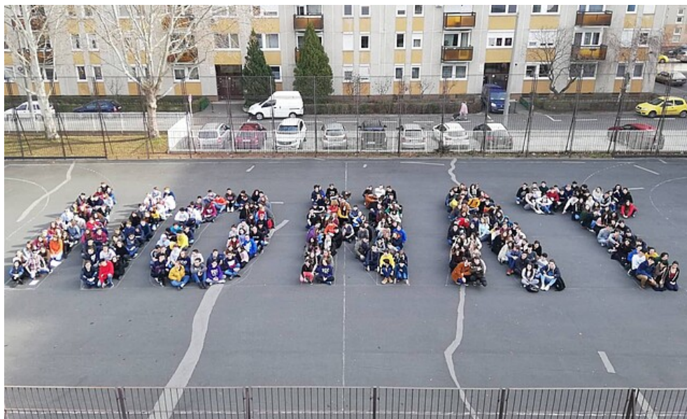
School protest against the new National Core Curriculum, February 2020