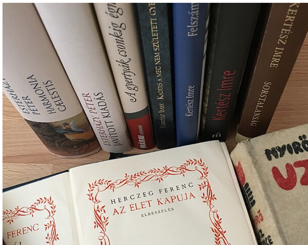
Who is part of the canon? Esterházy and Kertész are no longer, but Herczeg, Nyirő and Wass are